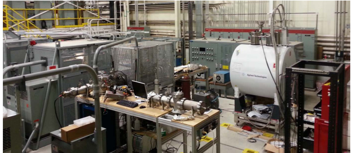
FIG. 1. The TAMUTRAP facility as of 4/16/13

Over the past year, significant progress has been made toward the commissioning TAMUTRAP (Fig. 1). The geometry for the large, open-access Penning trap has been finalized and shown to be theoretically competitive with traps employed in other prominent facilities [1]. Critical systems such as the high voltage platform, power supplies, radio frequency (RF) voltage systems, and gas pressure controls for various beam line elements have been commissioned. Testing of several meters of beamline as well as the RFQ Paul trap used to bunch the incoming beam and lower emittance has begun with an offline ion source, and beam transmission through these elements has been confirmed. Additional beam optics have been fabricated and are currently being tested.