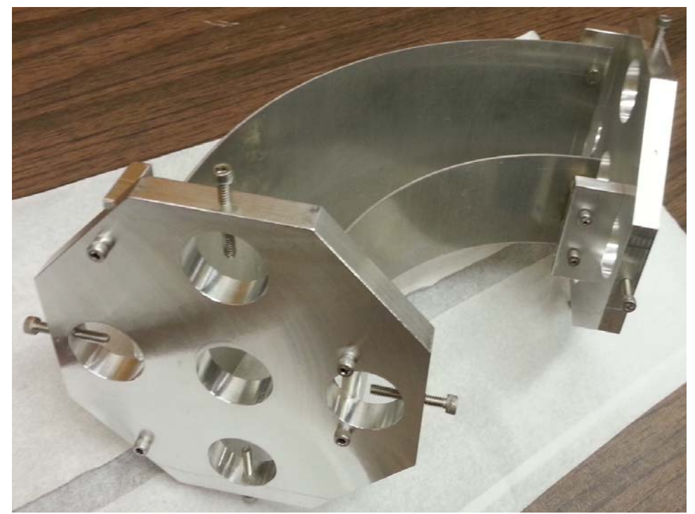
FIG. 3. The cylindrical ninety degree deflector currently awaiting testing.

Concurrent with the testing of the beam line and RFQ, additional beam optics and equipment to be needed later in the assembly of the facility were being fabricated and assembled. The beam optics on this list include the spherical deflector needed to bend the beam ninety degrees, a prototype cylindrical deflector (Fig. 3) that could be used for the same purpose (upcoming testing will indicate if its performance is satisfactory), and a pulsing cavity used to lower the beam energy for loading into the measurement trap. The cylindrical deflector is the first of these elements to be completed, and is currently awaiting testing.